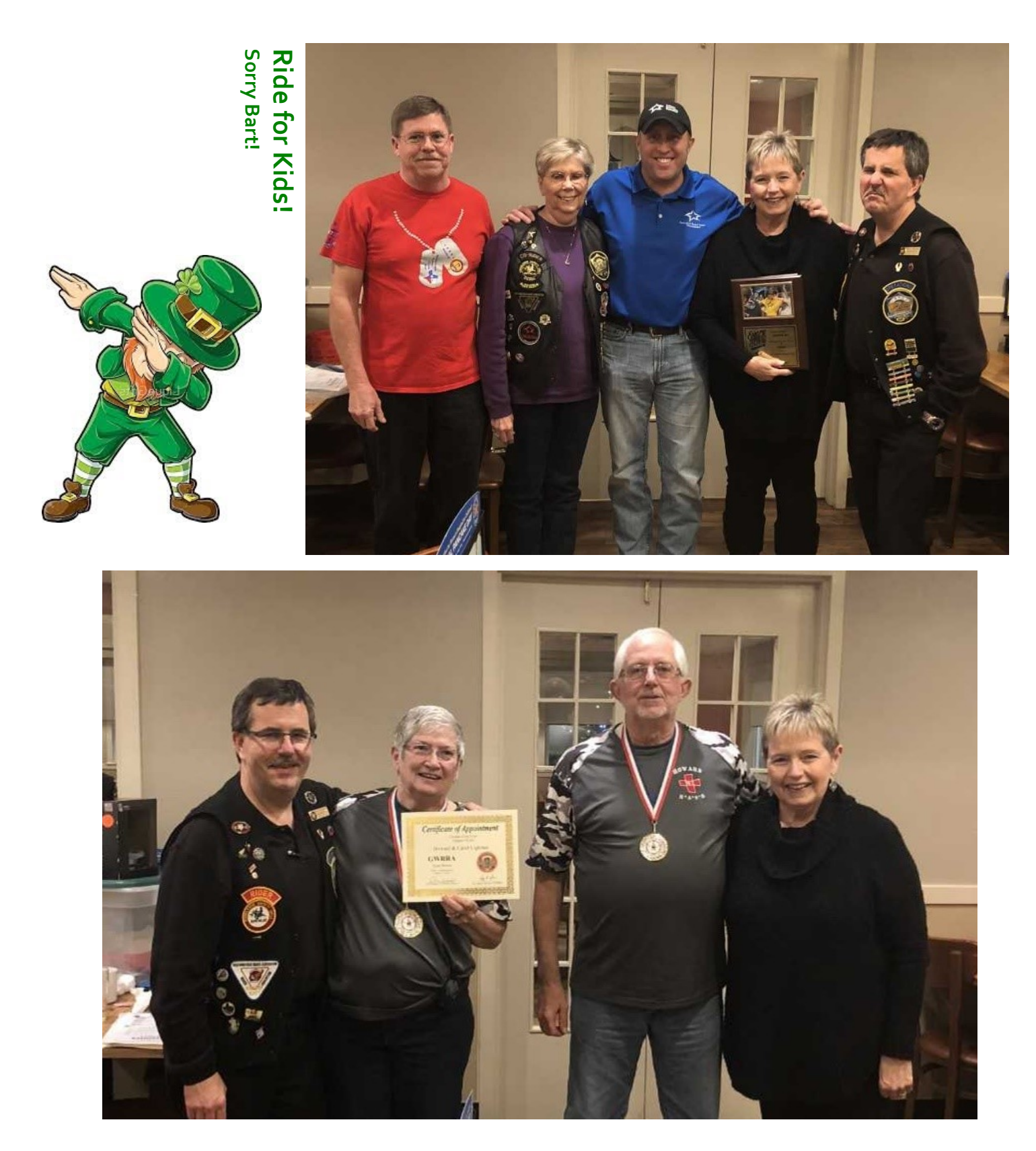
Chapter Couple of the Year get their medals just like Olympians!